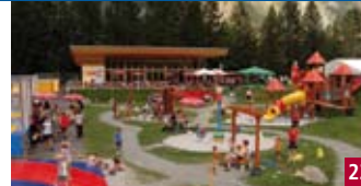
ÖTZTALER FUNPARK HUBEN/MÜHL

Normal rates without Ötztal Card Adults € 3.20 per round / Children (0-15 years) € 2.20 per round