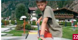
MINIGOLF- & PIT-PAT-ANLAGE LÄNGENFELD

Normal rates without Ötztal Card 3 hours: Adults € 16.50 / Children € 8.00; Day ticket: Adults € 23.50 / Children € 11.50 Surcharge fitness € 7.00 Surcharge sauna € 10.00