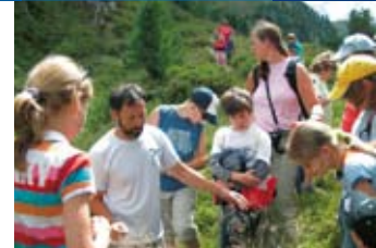
ÖTZTAL NATURE PARK MOUNTAINS CLOSE-BY

Normal rates without Ötztal Card Day ticket: € 5.00 Bungee trampoline € 2.50 for 5 minutes