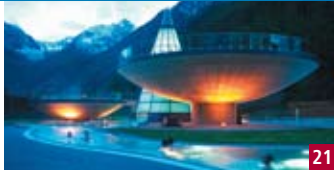
AQUA DOME – TIROL THERME LÄNGENFELD*